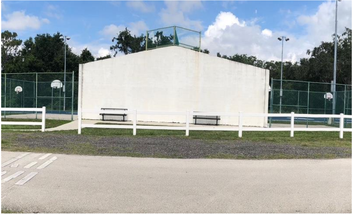
Round Lake Park Mural Wall Photo